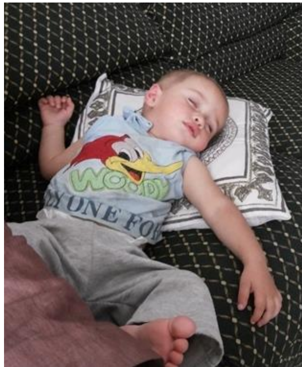
Her child that has cancer

This mother lives with her 5 children on 3 mattresses in a two room flat in Damascus. Her husband is missing. She has two sick children. Her baby has cancer and another one has a severe bowel problem. The team gave them mattresses, food and health care boxes, clothes, milk and money to pay the rent for 4 months.