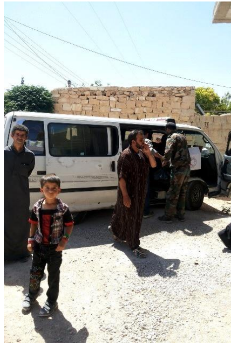
Dispatching of food and health supplies in the city of Sehl (200 food and healthcare boxes)