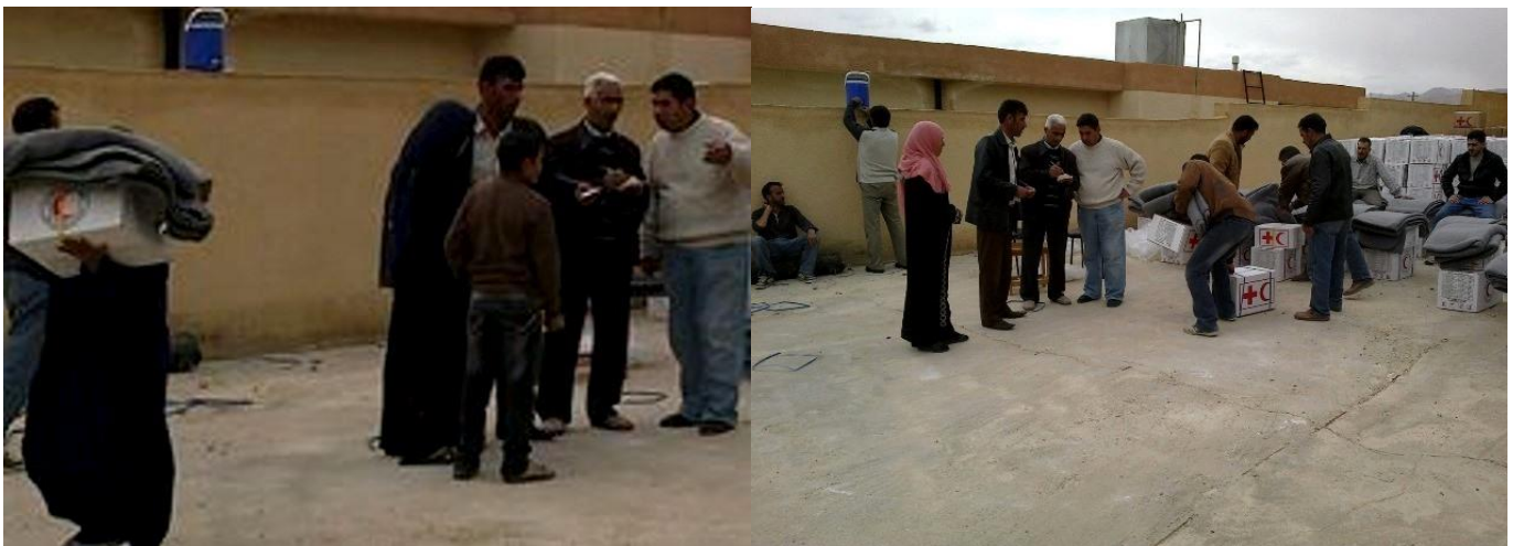
Dispatching of food, health supplies and 600 blankets in the city of Jreijir (Damascus country side)