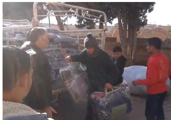
Dispatching of food and health supplies in the city of Ma'moura